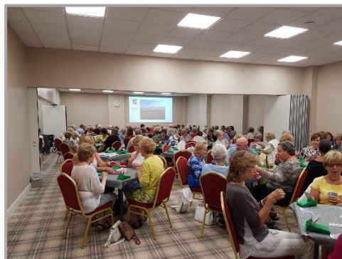
Today's vibrant centre!