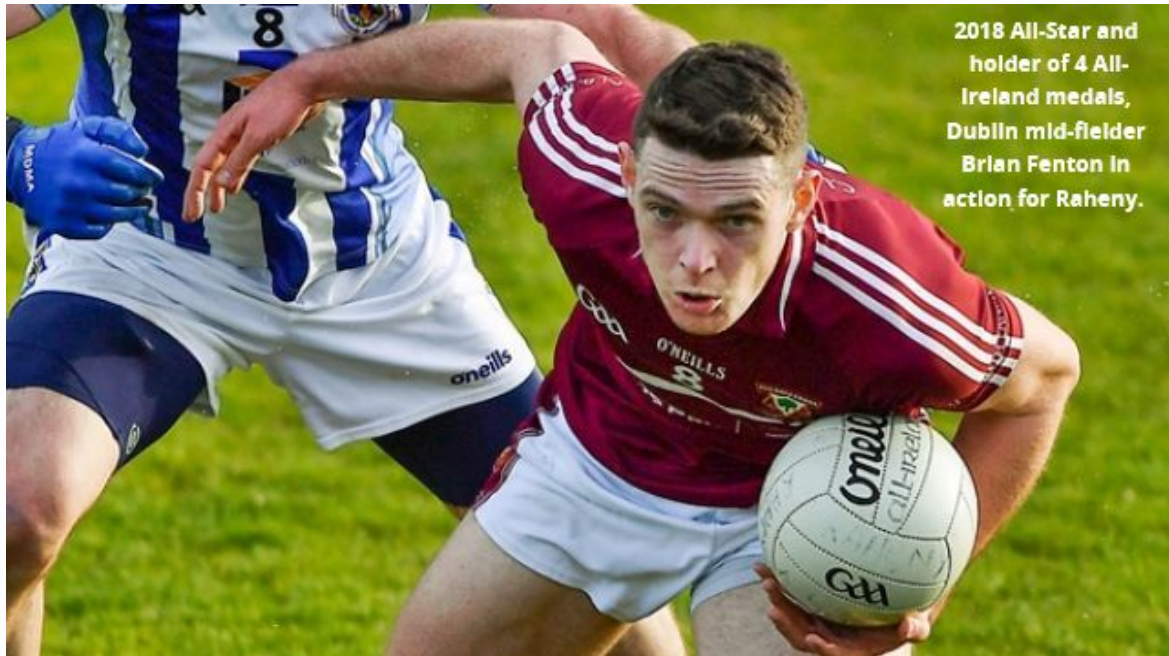
2018 All-Star and holder of 4 All-Ireland medals, Dublin mid-fielder Brian Fenton in action for Raheny.

It is woven so deeply into our social fabric that the well-being of a community is often assessed by reference to the health of the local GAA club.